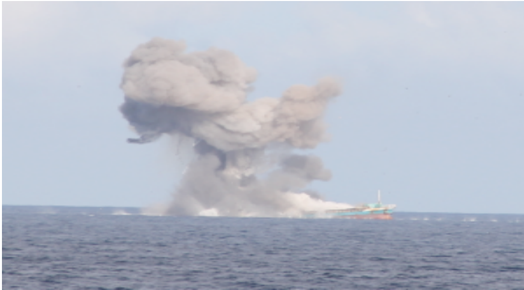
Drug vessel MV ALNOOR which was blown up at the Ocean in Mombasa.